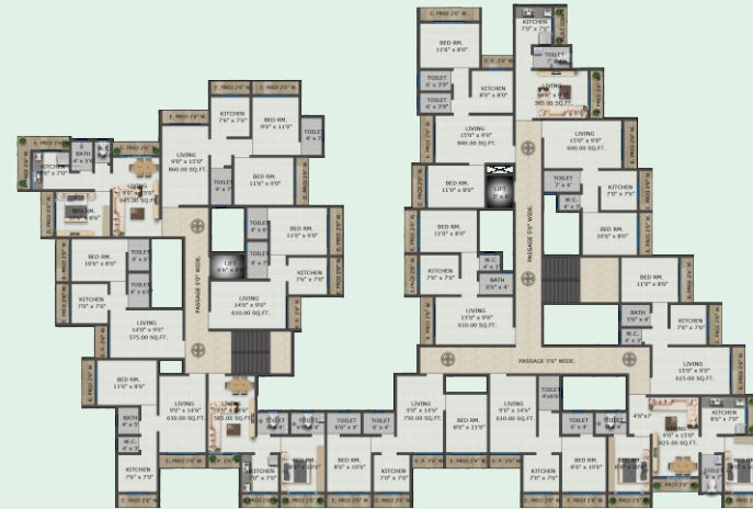
2ND, 4TH & 6TH FLOOR PLAN